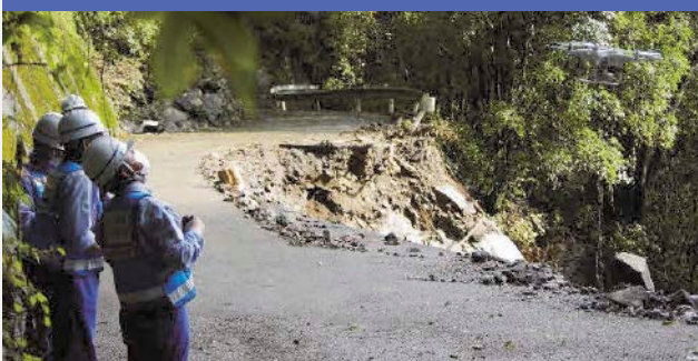
▲ TEC-FORCE members are using drones to survey disaster-affected area.

TEC-FORCE, Kyushu Regional Development Bureau, Ministry of Land, Infrastructure, Transport and Tourism