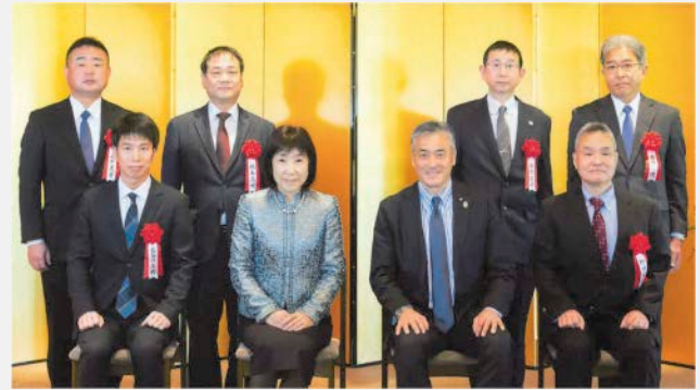
▲ NPA President's Award ceremony (February 2024)

The NPA President's Award annually recognizes national public employees who made outstanding achievements in improving public service and people's lives through steady dedication over the years or courageous activities under high motivation from among a wide variety of jobs in the ministries and agencies. Awardees are selected through strict examination and deliberation of the selection committee comprising of learned and experienced experts from various fields. After the award ceremony, they have the honor to meet the Emperor and the Empress.