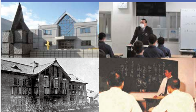
▲ School building and scene of the class, now (above) and in the past (below).

Naniwa Juvenile Training School, Ministry of Justice