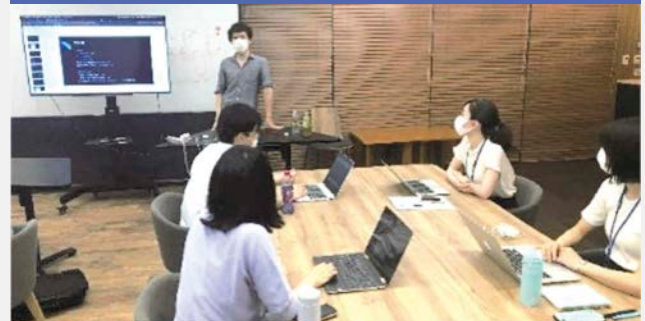
▲ The Team sponsors programming workshop for employees.

TECH FORMING Team, Policy Open Laboratory, Financial Services Agency