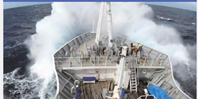
▲ Crew members are conducting fishery research in bad weather condition.

Crew Members, Kaiyo-Maru, Fishery Research Vessel, Fisheries Agency