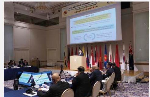
▲ ACCSM+3 International Symposium