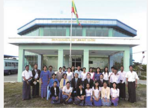
▲ Work scene of the dispatched personnel (Dispatched personnel: Center row, fourth from left)