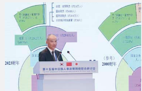
▲ China-Japan-Korea Personnel Policy Network 15th Joint Symposium