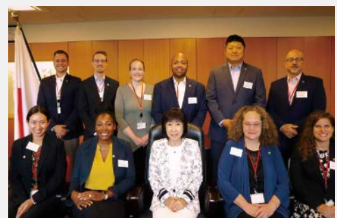
▲ Trainees for the 27th Mike Mansfield Fellowship Program