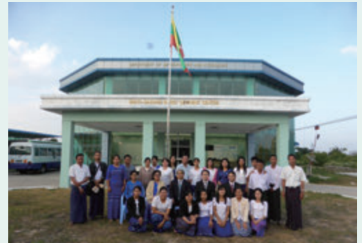
▲ Work scene of the dispatched personnel (Dispatched personnel: Center row, fourth from left)