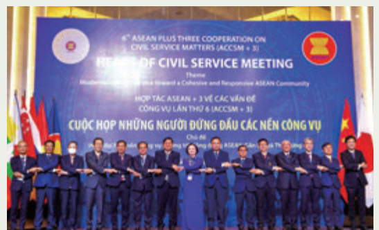
▲ The Heads of Civil Service Meeting for the 6th ACCSM+3

Responding to requests from developing countries to improve their governance by studying Japanese civil service system, the NPA cooperates by carrying out various training programs targeting government officials from these countries. Also, the NPA works with the ASEAN Cooperation on Civil Service Matters (ACCSM) in conducting various cooperative activities.