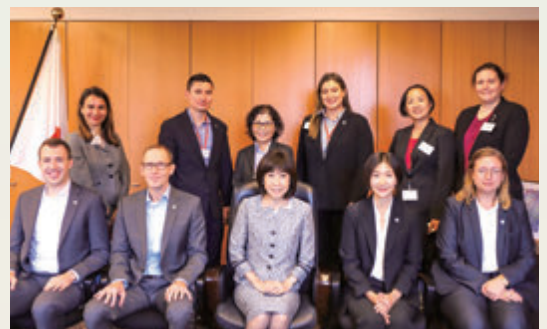
▲ Trainees for the 26th Mike Mansfield Fellowship Program

The NPA invites senior government officials of foreign countries to Japan in order to exchange information on recent practices and issues of personnel administration. Also, the NPA carries out the program (Mike Mansfield Fellowship Program) to offer young and mid-level U.S. federal government officials the opportunity to take one-year on-the-job training at the ministries and agencies, etc.