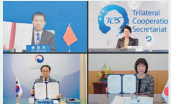
▲ The 9th China-Japan-Korea Personnel Policy Network Heads Meeting

With the aim of promoting close cooperation and mutual exchange in the field of personnel administration as part of the trilateral cooperation program, the personnel administration agencies in Japan, China and Korea, namely the NPA, the National Civil Service Administration of China and the Ministry of Personnel Management of Korea, implement various cooperation programs.